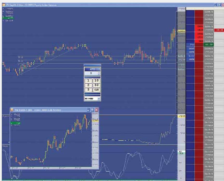
Figure 2. X_STUDY workspace

we were eager to beta test X_TRADER 7 to better understand its capabilities and we came away very excited about the new performance enhancements. We also believe that X_STUDY, the multitude of new order types supported, and the many other new features in X_TRADER 7 will keep TT at the leading edge of trading software development."